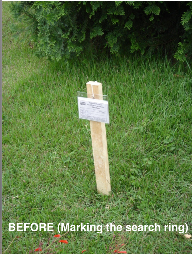
BEFORE (Marking the search ring)