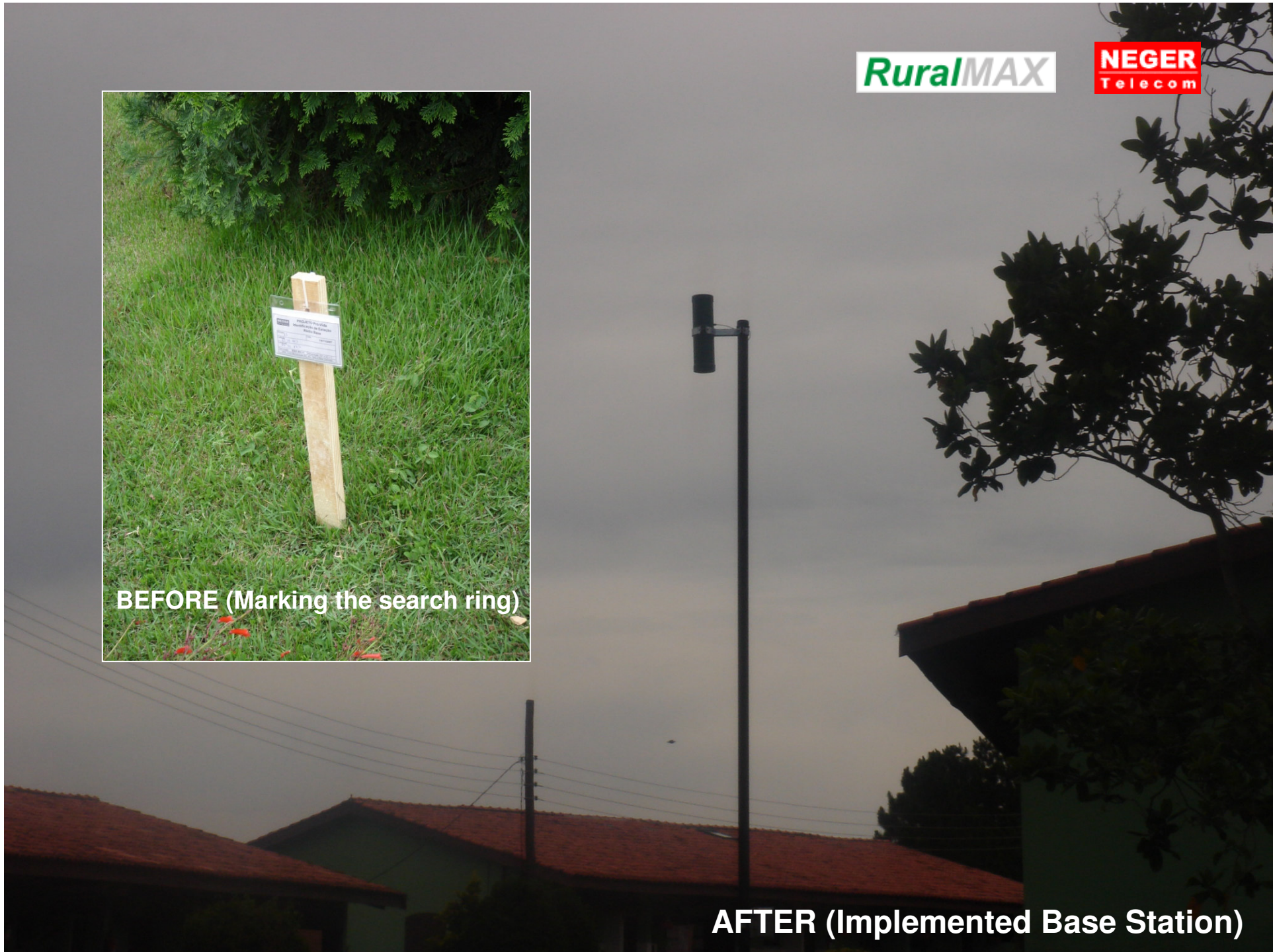
AFTER (Implemented Base Station)